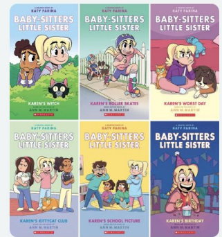
BABYSITTERS CLUB SISTERS CAD$15.00