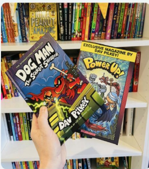
DOG MAN BOOK SERIES CAD$20.00