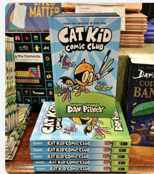
CAT KID BOOK SERIES CAD$20.00