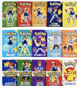
POKEMON BOOKS CAD$20.00