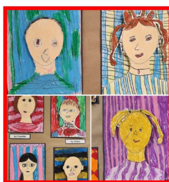
Division 2 (Left) Grade 1 & 2 Cohort (Right)