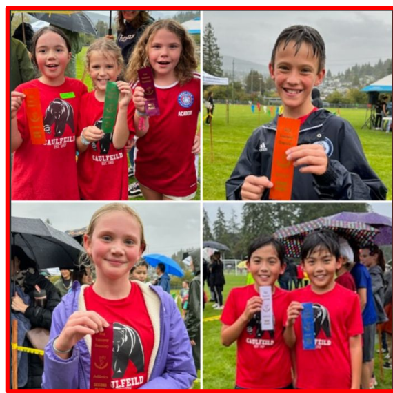
Pictured: A few of our ribbon winners at the first Cross Country Meet. A scene from the Terry Fox Run

Throughout the year, our teachers will share with families more about their Units of Inquiry, as well as their use of digital tools. I look forward to seeing the learning unfold.