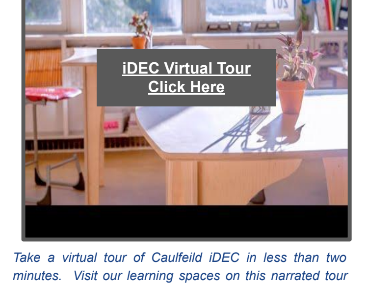
Take a virtual tour of Caulfeild iDEC in less than two minutes. Visit our learning spaces on this narrated tour and begin to understand more about our vision for learning. Please share this video with potential new families to help them learn more about All Things iDEC.