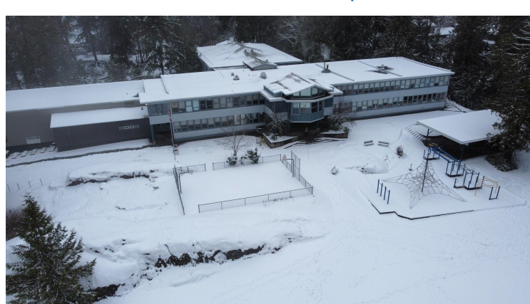
A winter flight with our iDEC drone to capture the quiet and snowy view of our school while closed today.

https://westvancouver.schools.ca/news/weather-closures-and-procedures