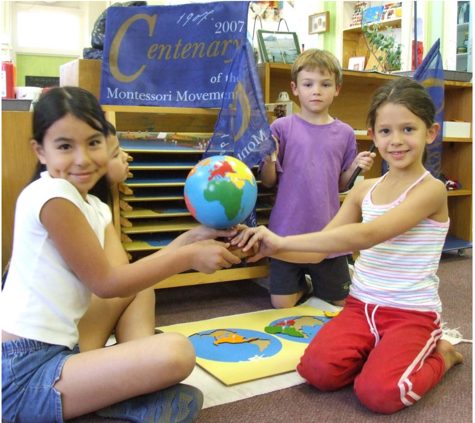
Children around the world celebrated the Montessori Movement's 100th year in 2007.